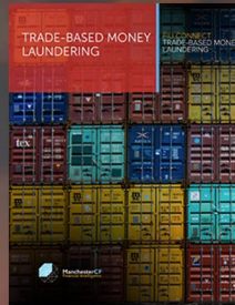
Trade-Based Money Laundering

FIU Connect is the platform for 13 online training programs on a variety of anti-money laundering and anti-terrorist financing subjects: