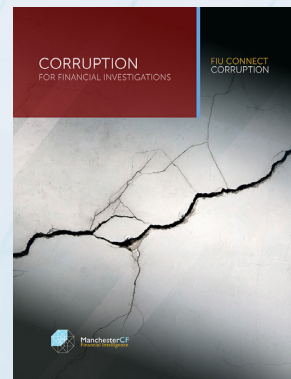
FIU CONNECT (Corruption)

All FIU CONNECT modules are on-demand training programs and self-paced. An average of 8-10 hours is required to complete one of the six courses. Components include a digital textbook, reference documents and knowledge assessment.