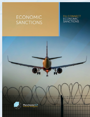
FIU CONNECT (Economic Sanctions)