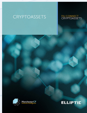
FIU CONNECT (Cryptoassets)

Individuals enrolled in the FCC certificate program are required to complete all six of the following courses with a grade above 80% for each courses: