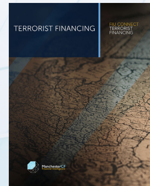
FIU CONNECT (Terrorist Financing)